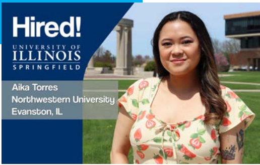
Educational Leadership major to Admissions Manager