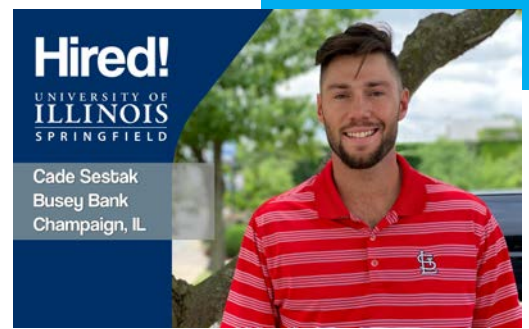
Business Administration (MBA) major to Commercial and Wealth Analyst