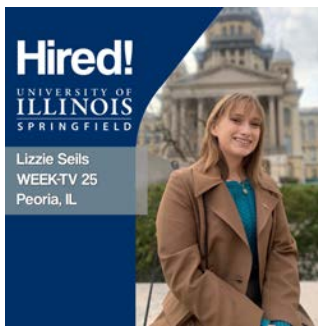
Public Affairs Reporting major to Multimedia Journalist